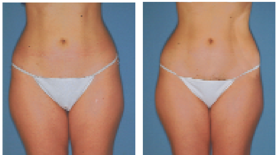
Figure 1 Patient pre-treatment (left) and post-treatment (right). Hip and abdomen lipodystrophy circumferential reduction of 6.5cm reduction on the hips of 5.5cm